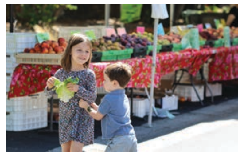
Orinda Farmers' Market celebrates 25 years.